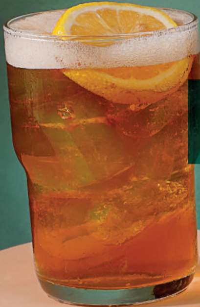
Iced Shaken Lemon Tea 32