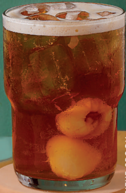
Iced Shaken Lychee Tea 32