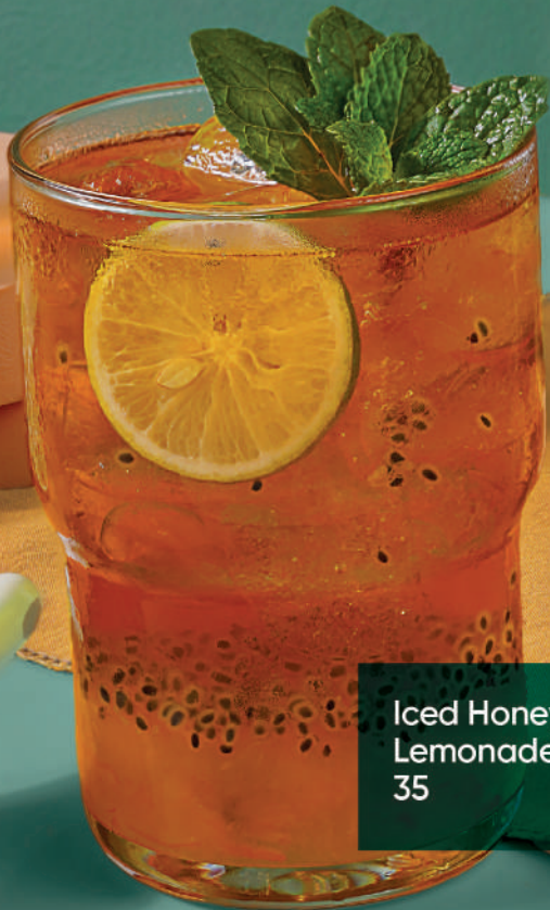
Iced Honey Lemonade Jasmine 35