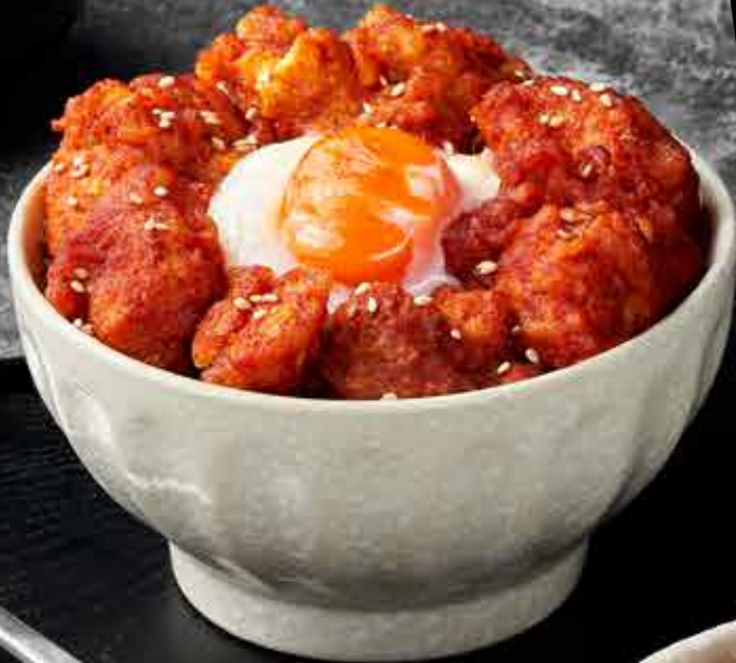
Dakganjeong Rice Bowl