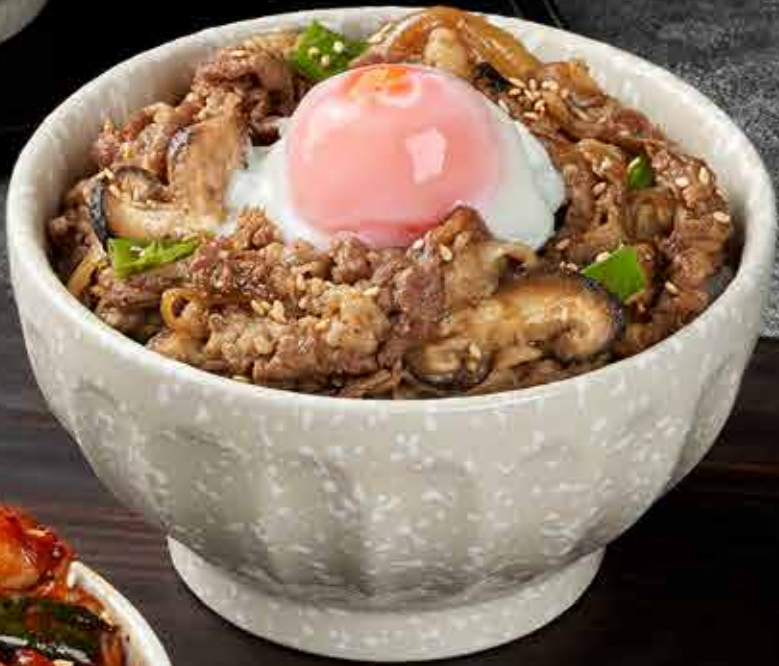
Dakgalbi Rice Bowl

Beef Bulgogi served with Rice and Onsen Egg.