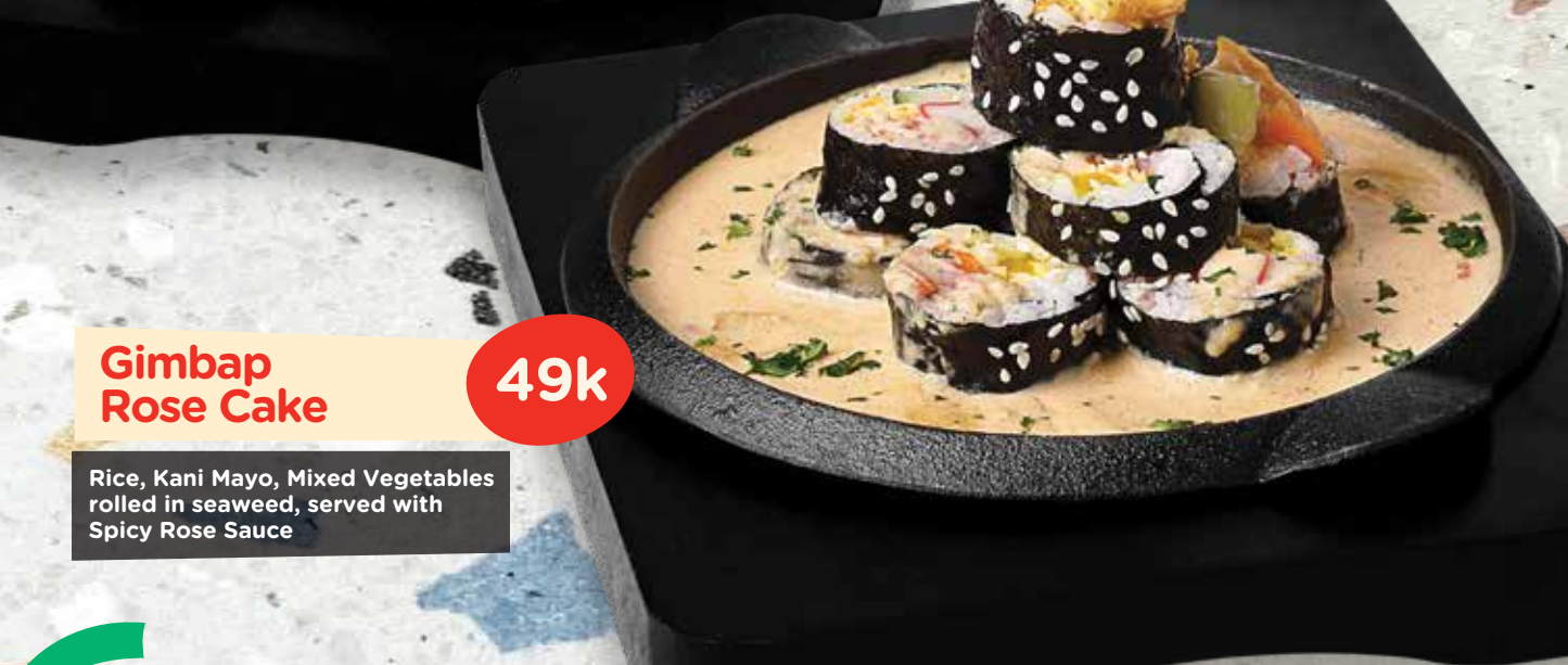
Gimbap Rose Cake

Rice, Kani Mayo, Mixed Vegetables rolled in seaweed, served with Tteokbokki Sauce