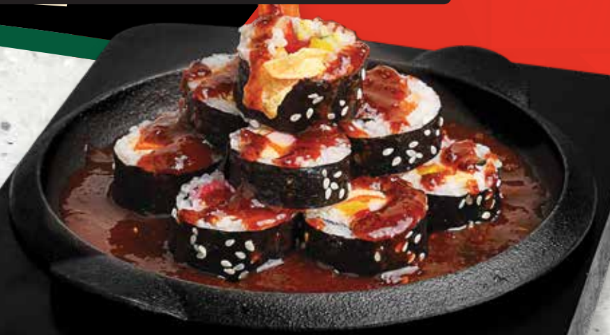
Gimbap Lava Cake