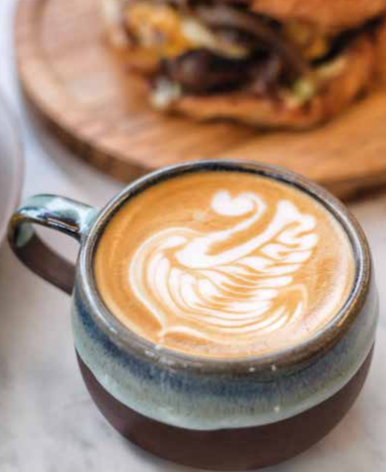
CAFE CAPPUCCINO | 39

Coffee, kampung chicken's egg yolk, ginger, honey.