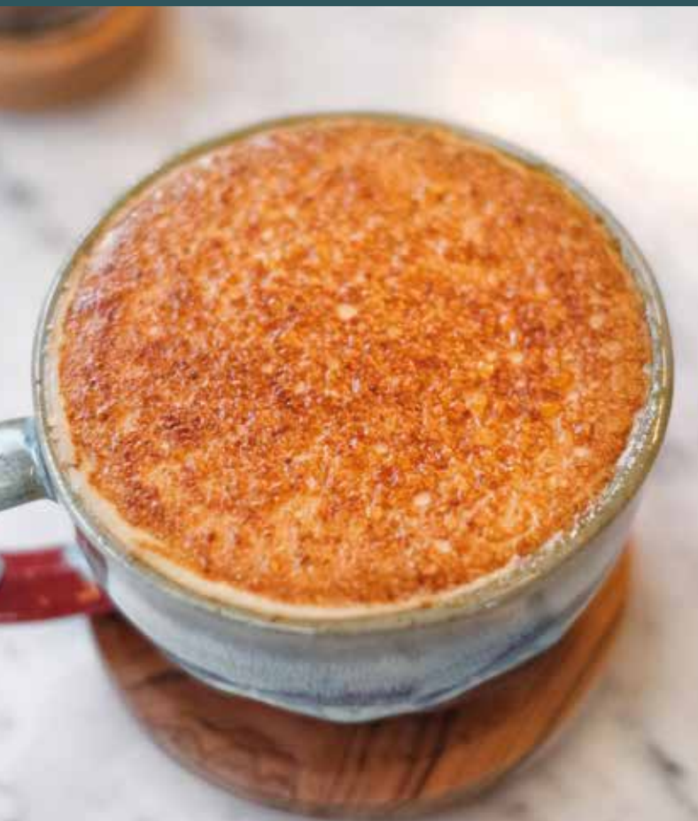
CRÈME BRÛLÉE LATTE | 41