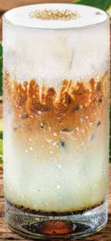
ICED KLEPON LATTE | 49