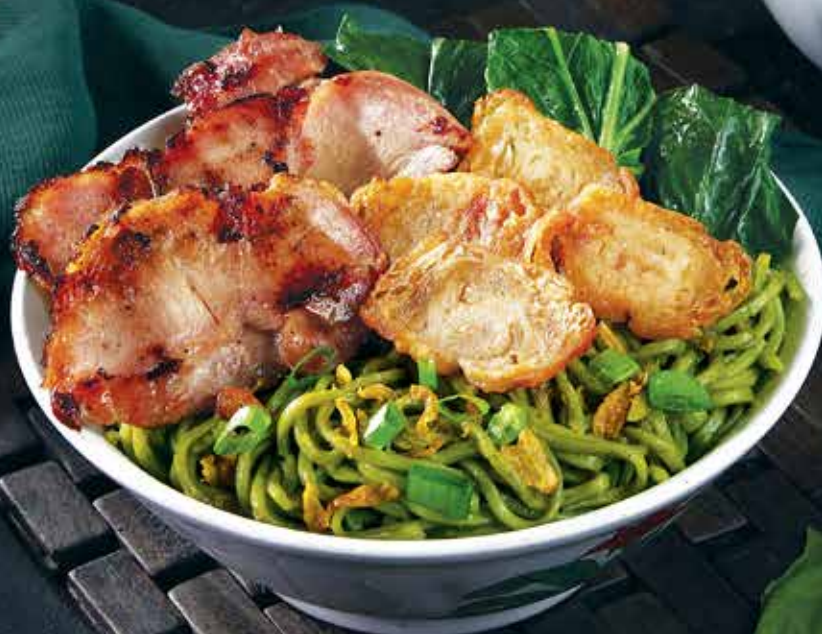
Mie Ijo Ayam Kyoto 42