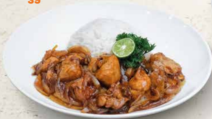
Nasi Ayam Goreng Mentega 39