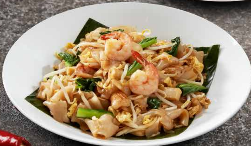
Kuey Teow Goreng Seafood 52