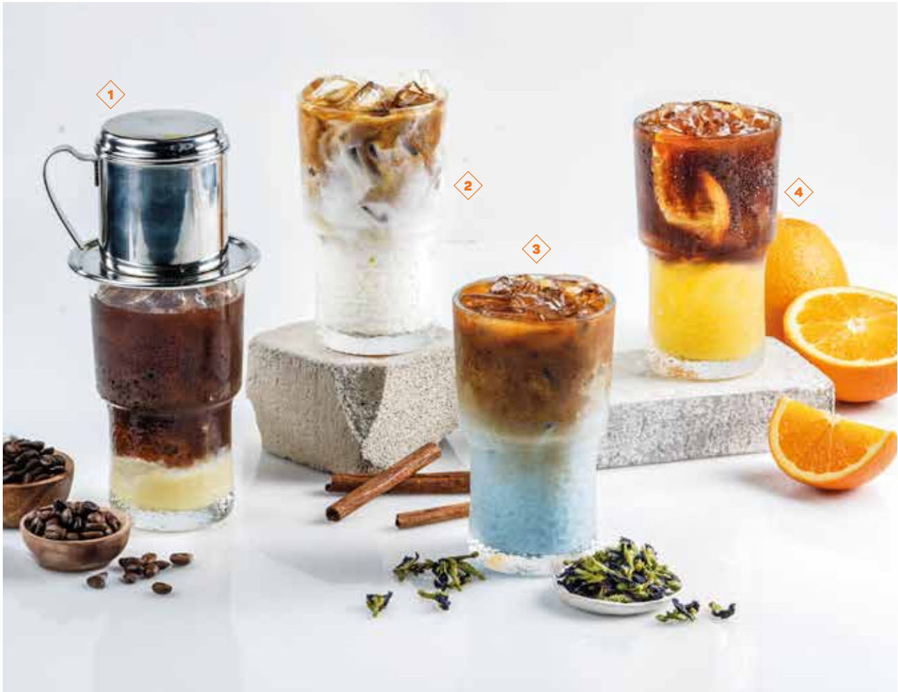
CROCO BY MONSIEUR SPOON