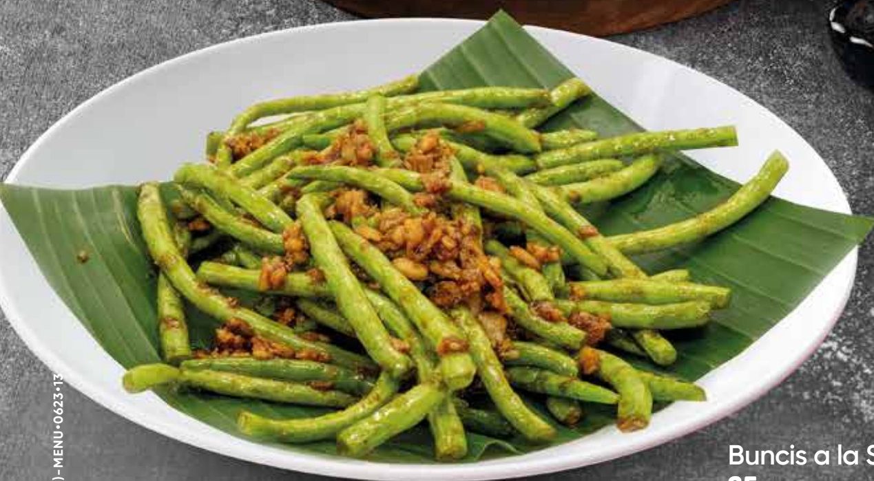
Buncis a la Sichuan 35