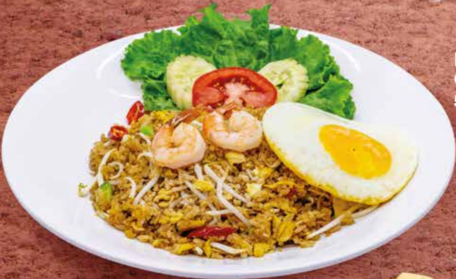
Nasi Goreng Chopstix 52