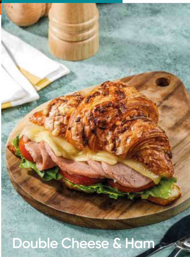
Double Cheese & Ham

*All prices are in thousand rupiah and subject to tax and service fees