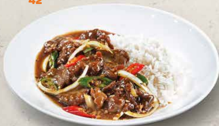
Nasi Sapi Lada Hitam 42