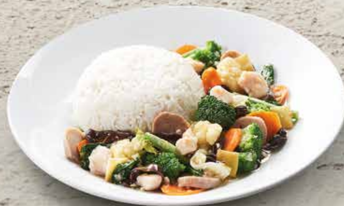
Nasi Capcay Ayam | 49