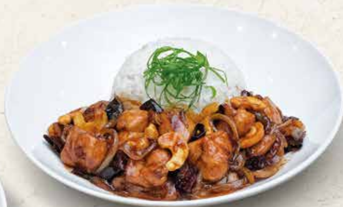
Nasi Kung Pao Chicken 42