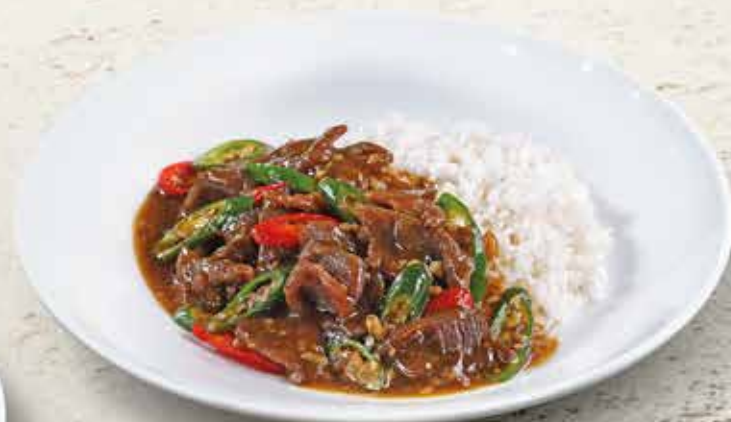
Nasi Siram Sapi Cabe Hijau 42