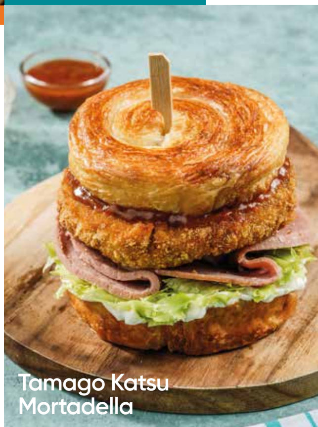
Tamago Katsu Mortadella