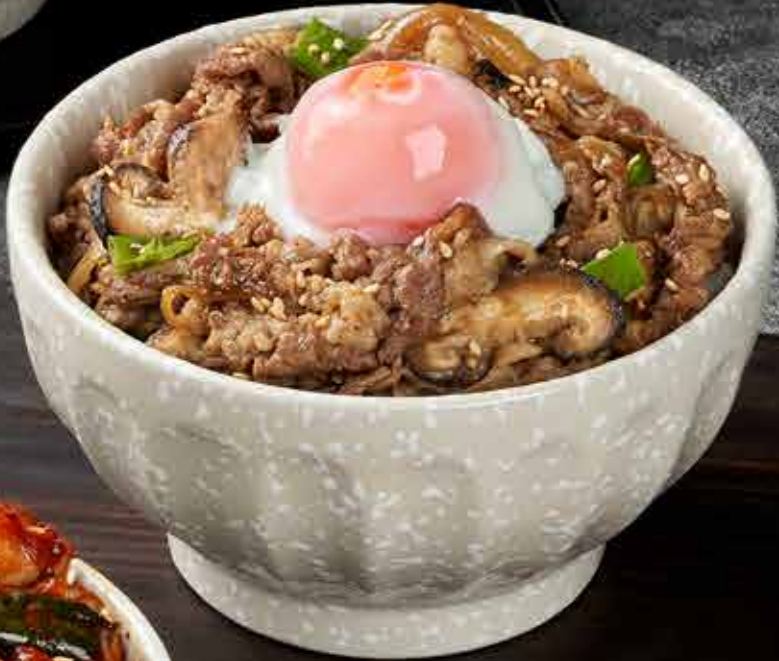
Dakgalbi Rice Bowl

Beef Bulgogi served with Rice and Onsen Egg.