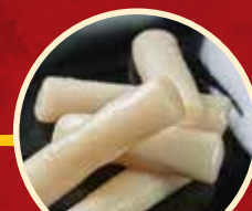
Extra Tteokbokki 12k