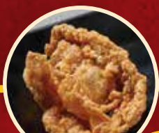
Chicken Skin 12k