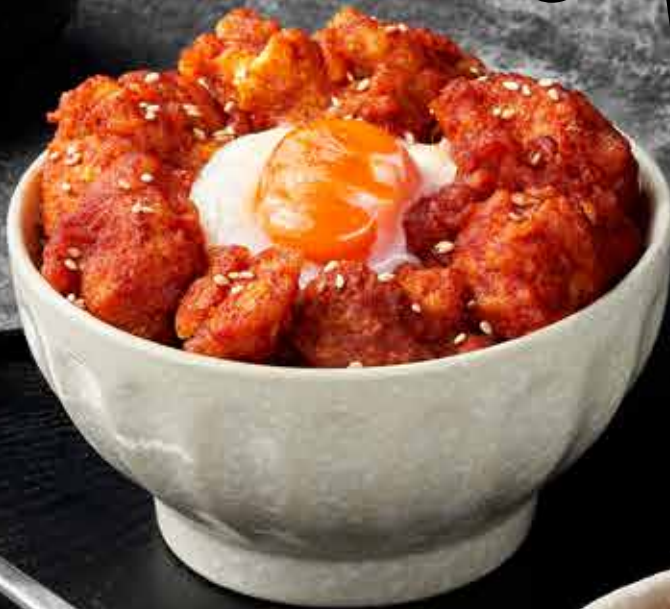
Dakganjeong Rice Bowl