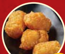
Tater Tots 15k