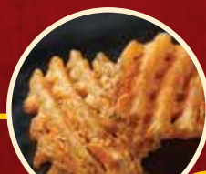
Waffle Fries 15k