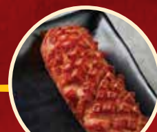
Cheese Sausage 20k