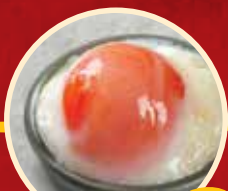
Onsen Egg 10k