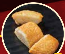
Fish Cake 12k