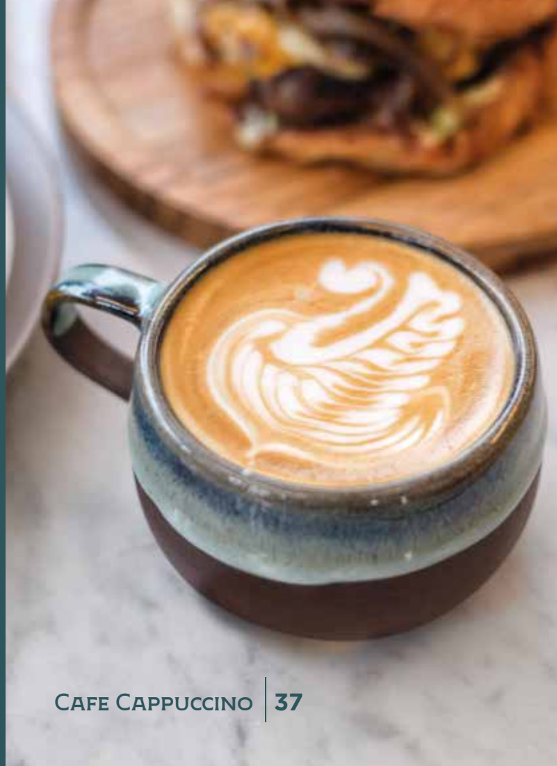
CAFE CAPPUCCINO | 37

Coffee, kampung chicken's egg yolk, ginger, honey.