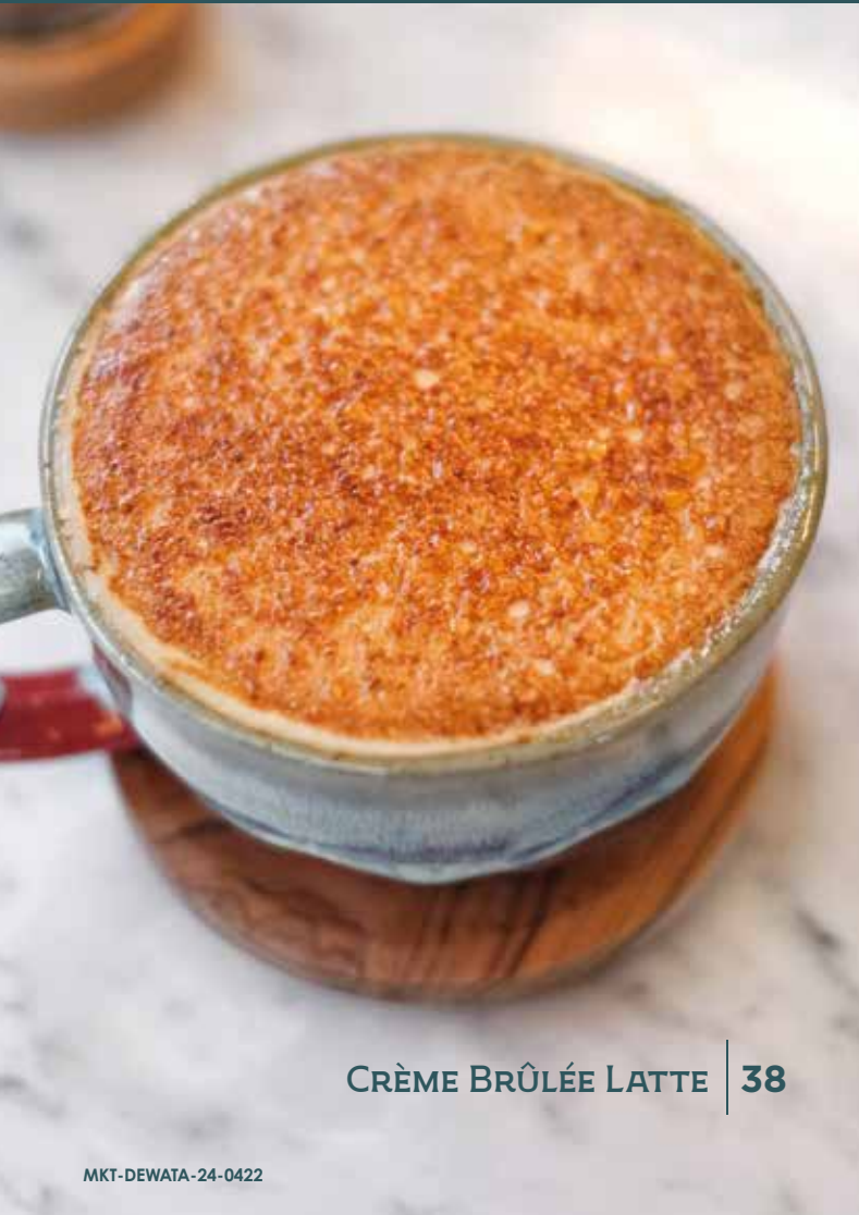
CRÈME BRÛLÉE LATTE | 38