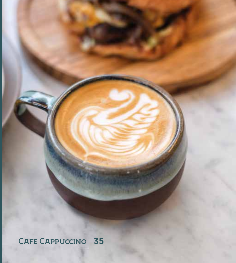
CAFE CAPPUCCINO | 35