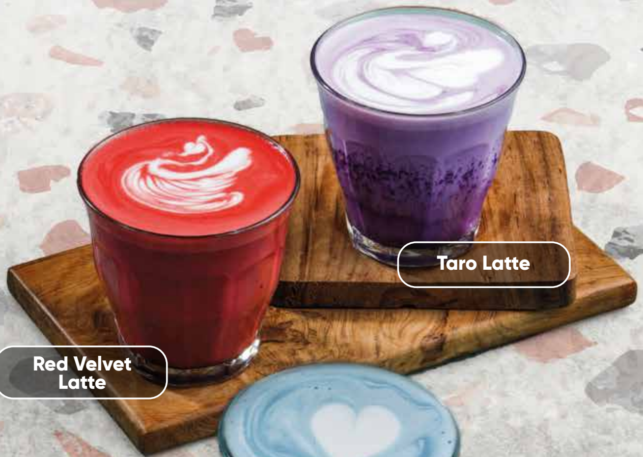
Red Velvet Latte