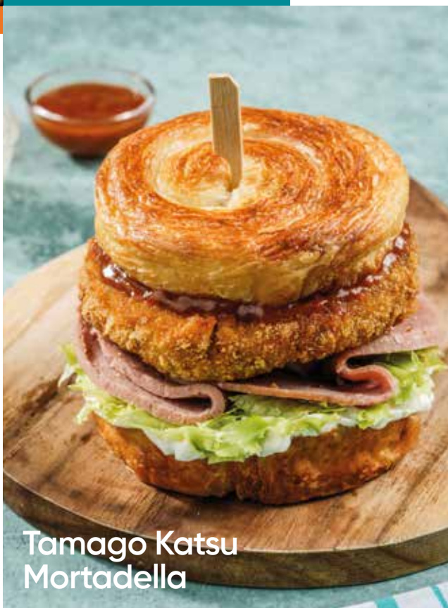
Tamago Katsu Mortadella