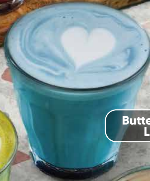
Butterfly Pea Latte