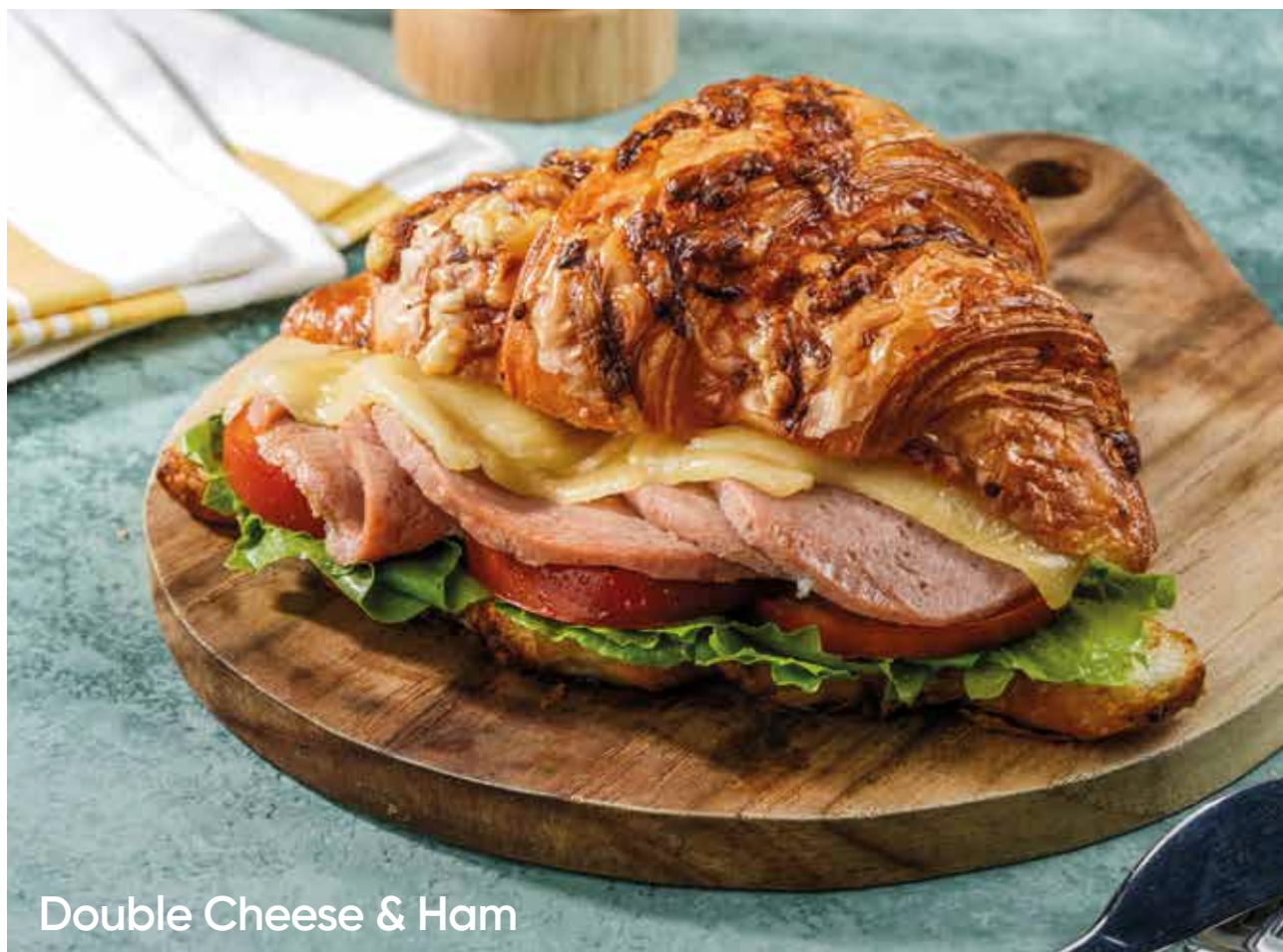
Double Cheese & Ham