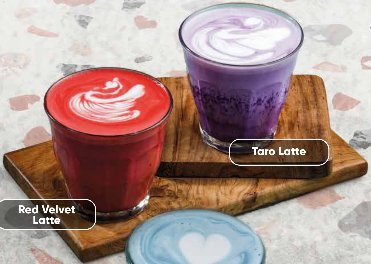
Red Velvet Latte