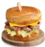
The Royal Pastrami

House smoked beef pastrami, onion, lettuce, cheese, aioli, house BBQ sauce.