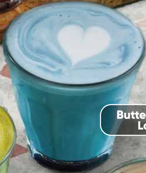
Butterfly Pea Latte