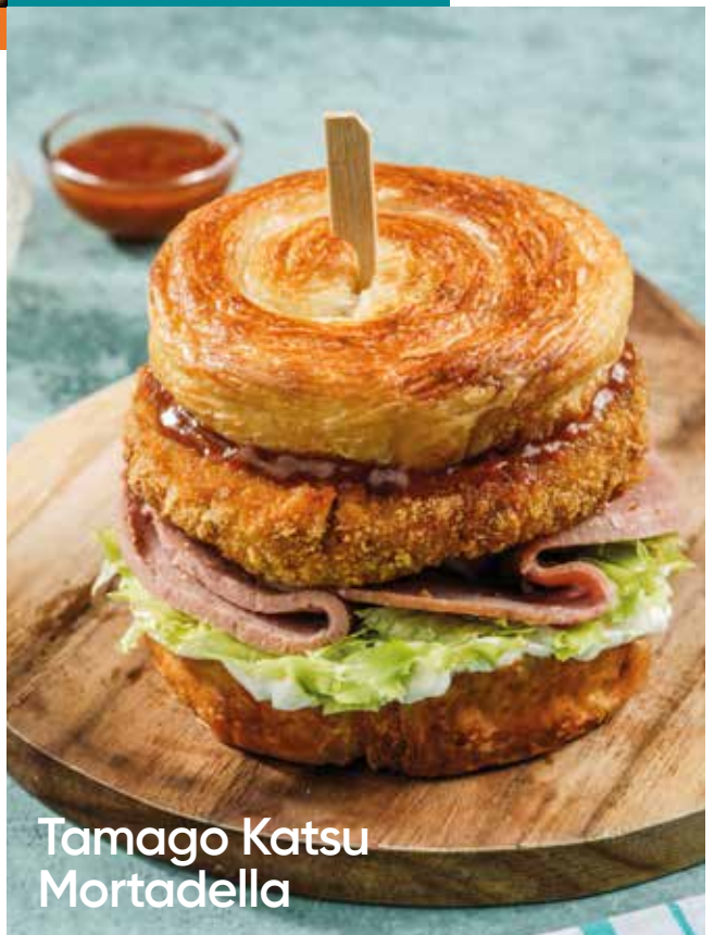
Tamago Katsu Mortadella