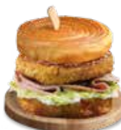
Tamago Katsu Mortadella

Tamago katsu, beef mortadella, tomato, iceberg, japanese mayo.