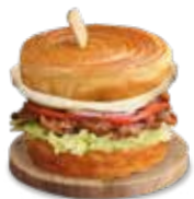
Pulled Brisket & Egg

Pulled angus beef brisket, onion, cheese, bbq sauce, sunny side-up egg.